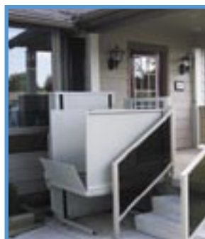
VERTICAL PLATFORM LIFTS